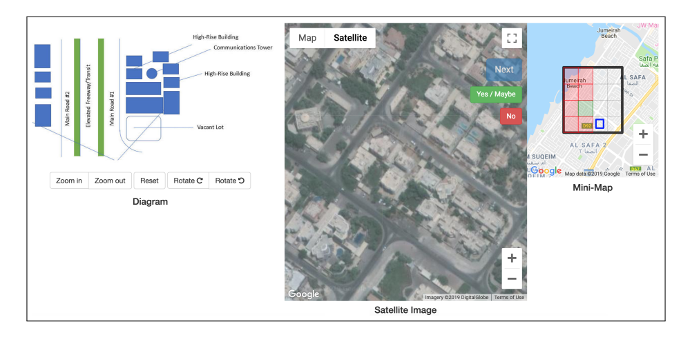
Fig. 3. Crowd worker interface. Note that this is a reproduction of what a real crowd worker would have seen during George's session, and includes the same aerial diagram that he created.

Step 2: Drawing the search area. Next, Noor delineates the search area that she thinks contains the photo by clicking on the Draw Search Area button, and then clicking and dragging the mouse cursor to draw opposing corners of a rectangular gridded map overlay. In practice, the area can be as large, or as small as one would like, based on constraints such as time, cost, the number of crowd workers available, etc. Next, the system automatically divides the search area into a grid of equally sized regions. Each region consists of a 4×4 grid of 16 cells , each of which are the same width as the aerial diagram provided by Noor, to allow for 1:1 comparison. Three crowd workers are asked to compare each cell to the aerial diagram provided by Noor.